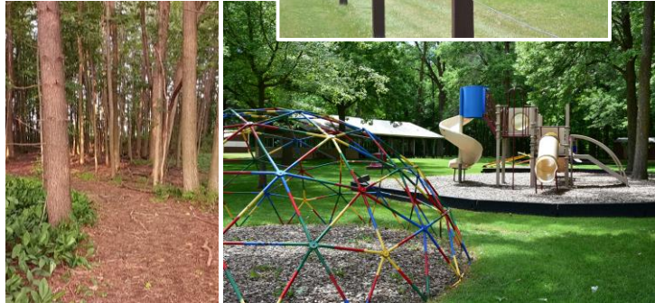
Trail access at park or Keller St.